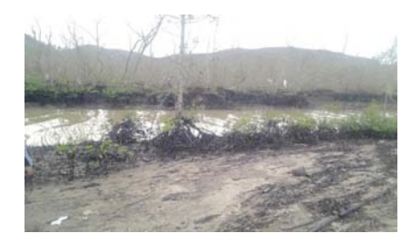
Estancia shoreline vegetation, especially the sensitive mangroves showed distress from lingering oil in the environment

"Current estimates by the management of the power barge amount to around 800,000 litres of oil having leaked. As the ruptured tanks continue to leak and up to 600,000 litres of oil remain in the tanks, the amount of spill is increasing steadily. Urgent action is required to pump out the remaining oil or seal the holes in the tanks."