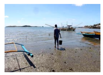
OSEI associate collecting Natural sea-water to mix with OSE II