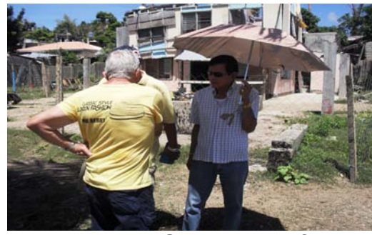
Mayor Cordero reached for his cell phone and called Governor Defensor mid way thru the OSE II application, and stated that "this stuff works and you need to take a look at it. The Governor indicated that he would look into OSE II and take action."